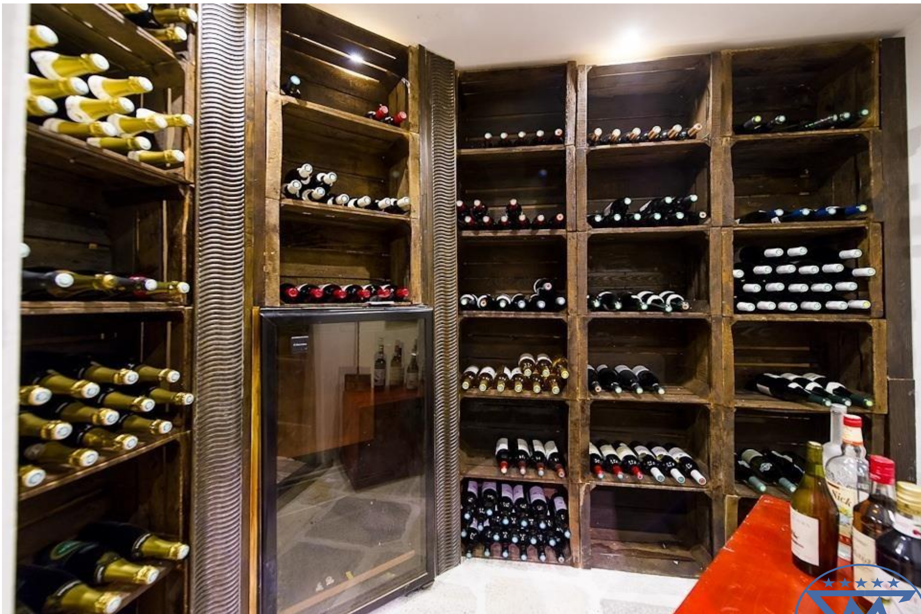
CHALET TOIT DU MONDE. Val d'Isere. France