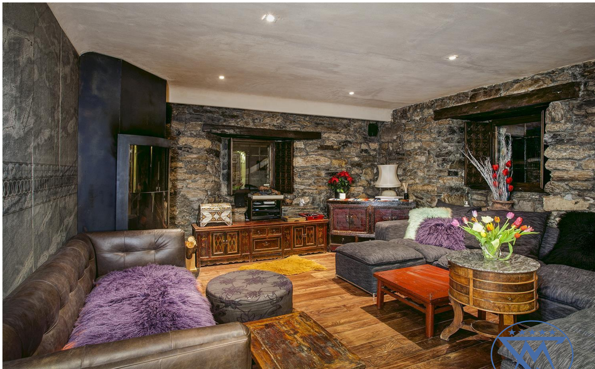
CHALET TOIT DU MONDE. Val d'Isere. France