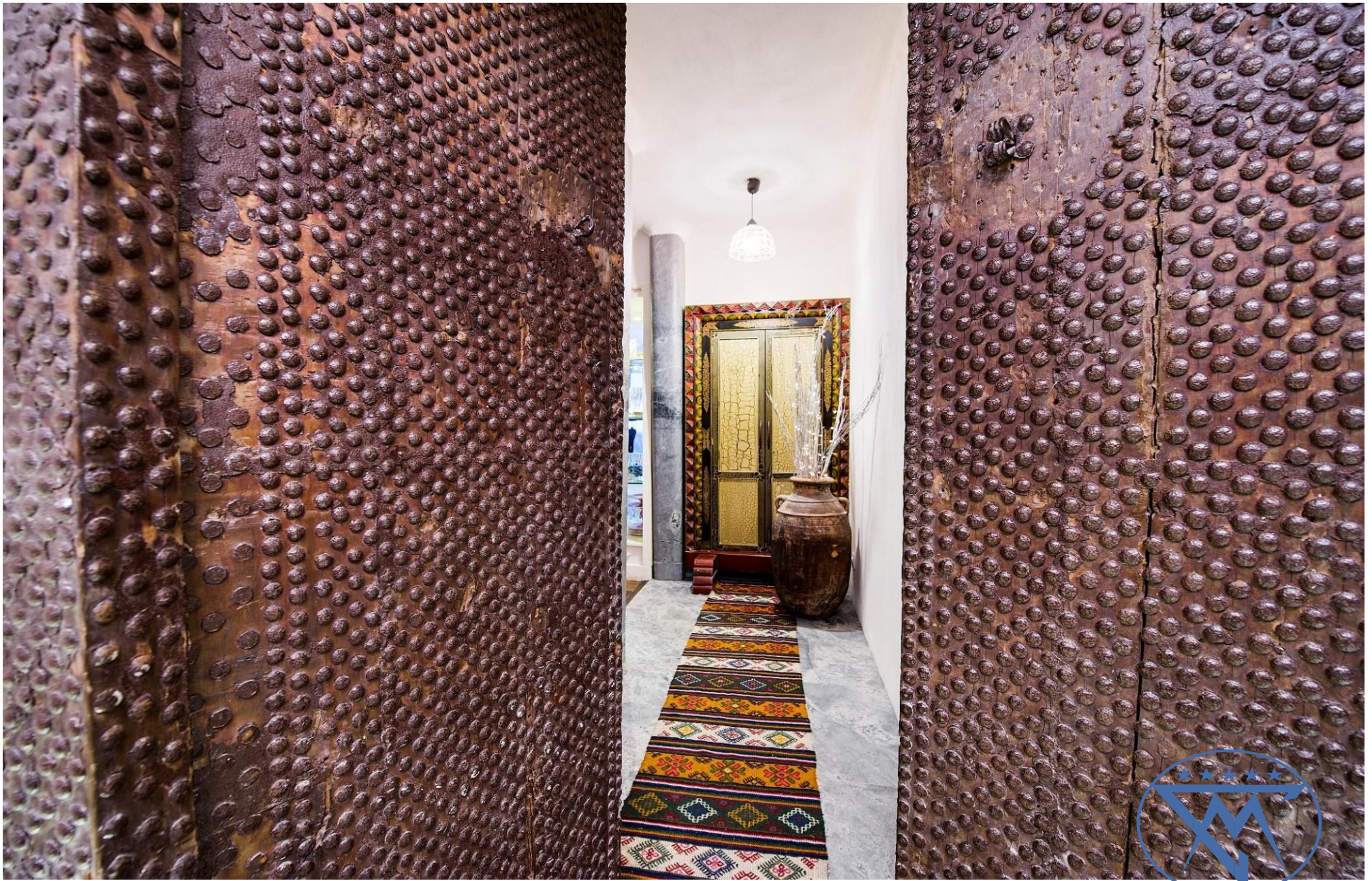
DOMAIN TOIT DU MONDE. Val d'Isere. France