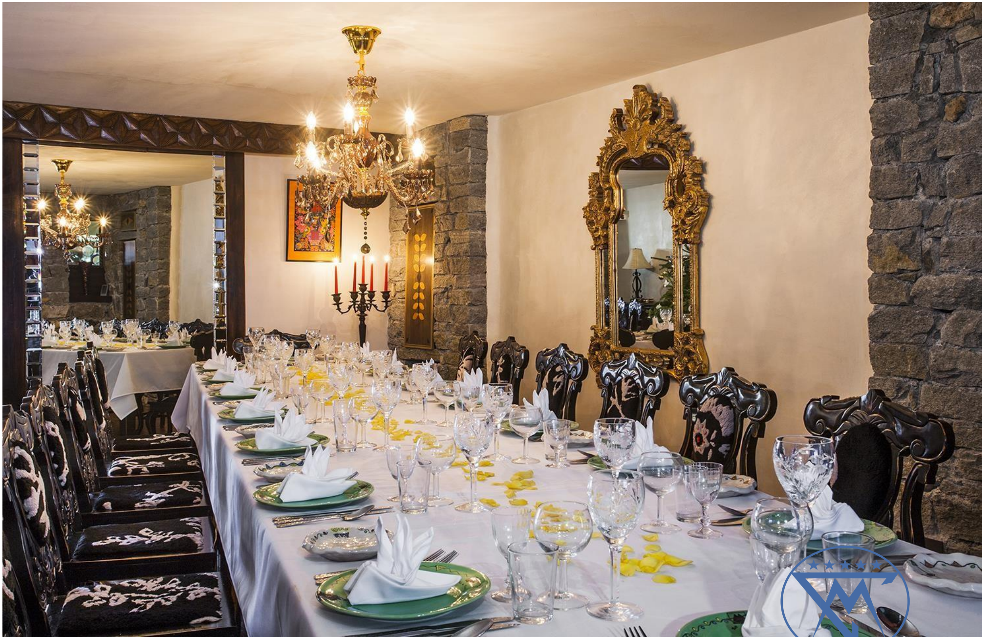
DOMAIN TOIT DU MONDE. Val d'Isere. France