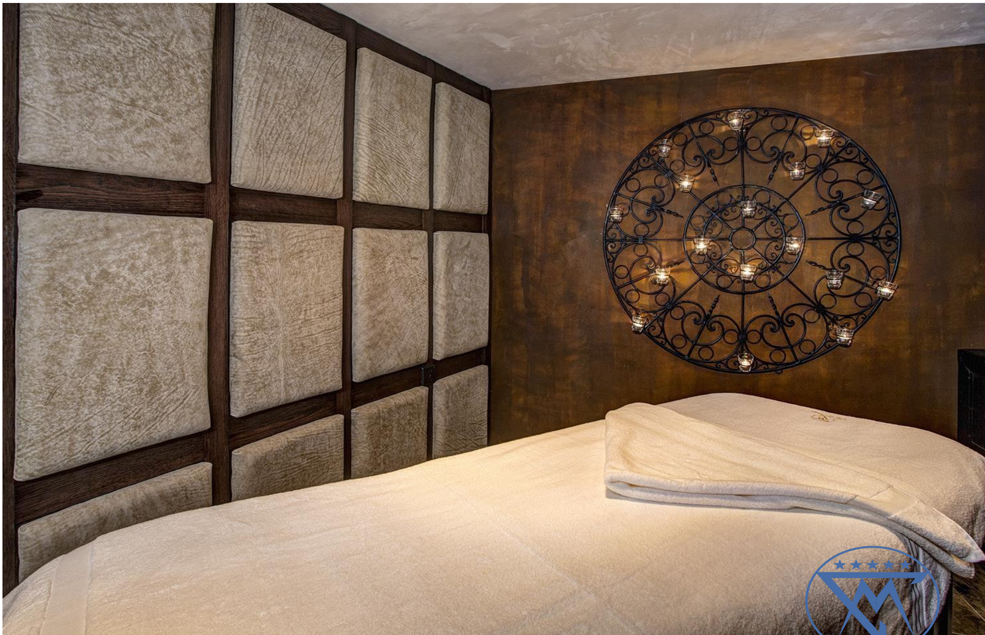
DOMAIN TOIT DU MONDE. Val d'Isere. France