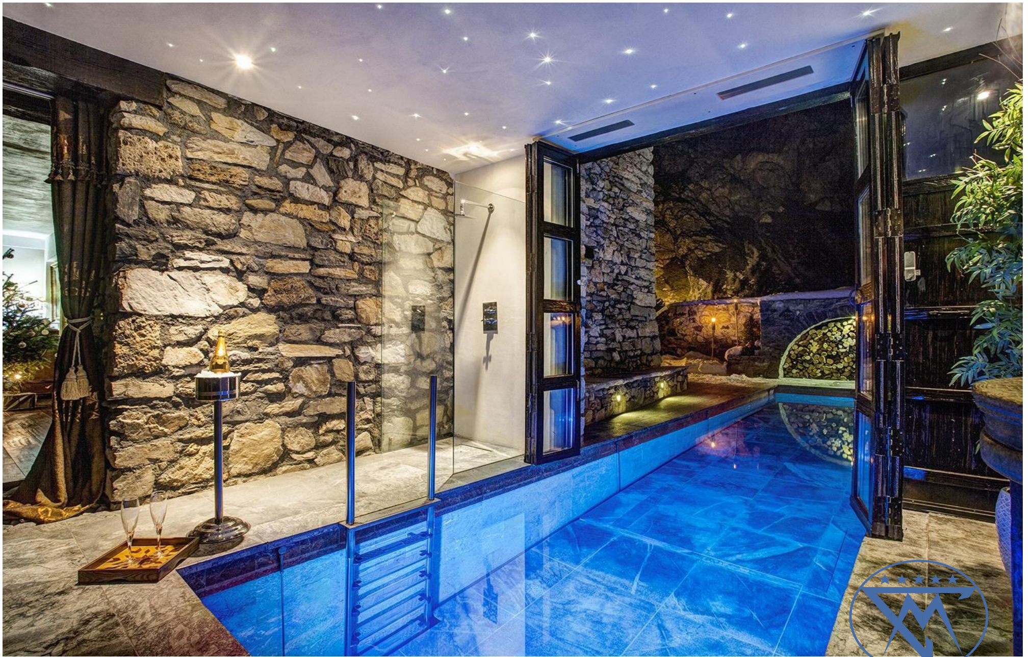
DOMAIN TOIT DU MONDE. Val d'Isere. France