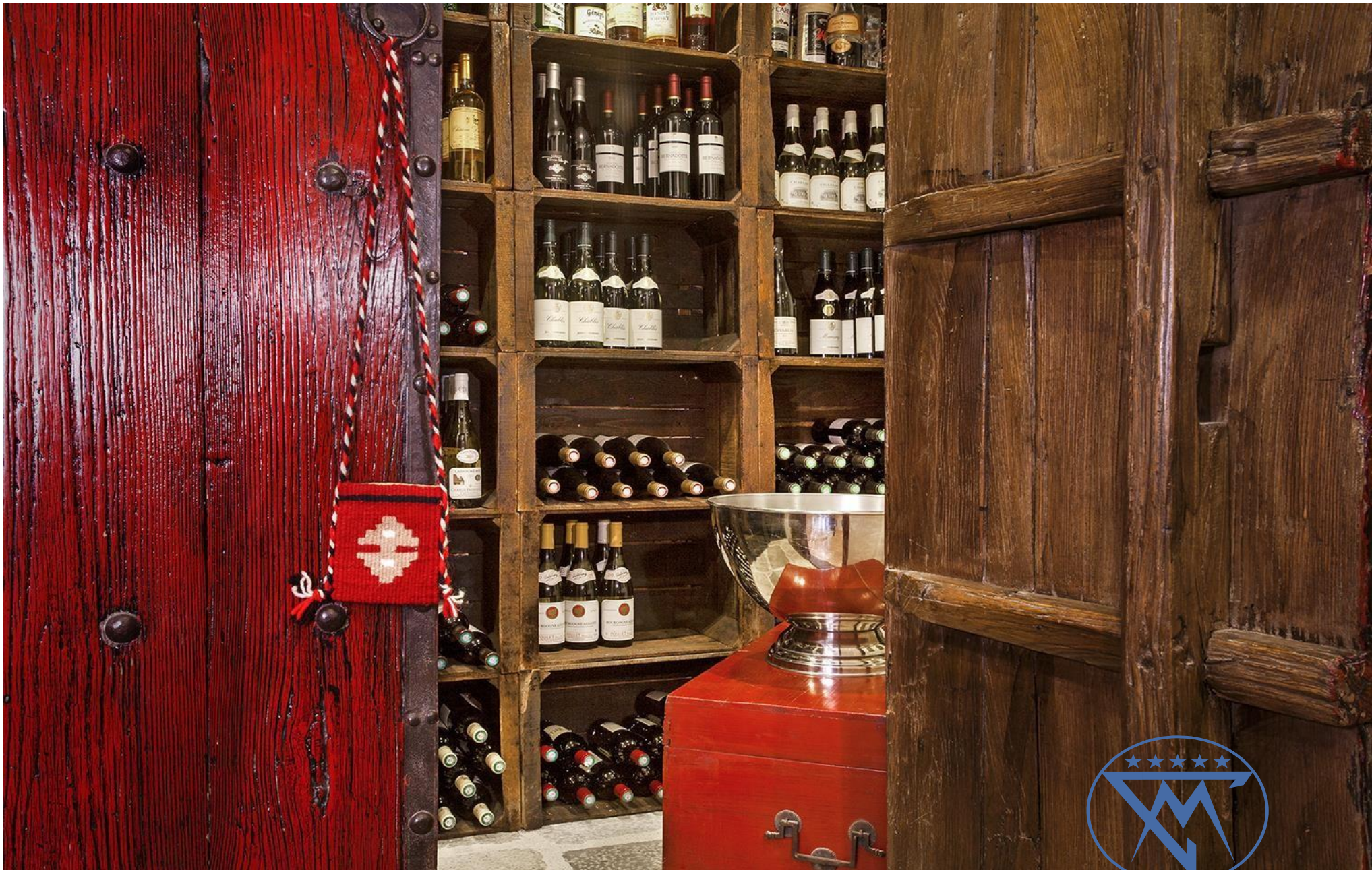
DOMAIN TOIT DU MONDE. Val d'Isere. France