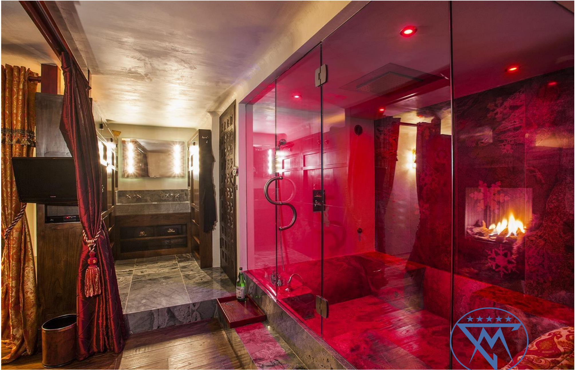
DOMAIN TOIT DU MONDE. Val d'Isere. France