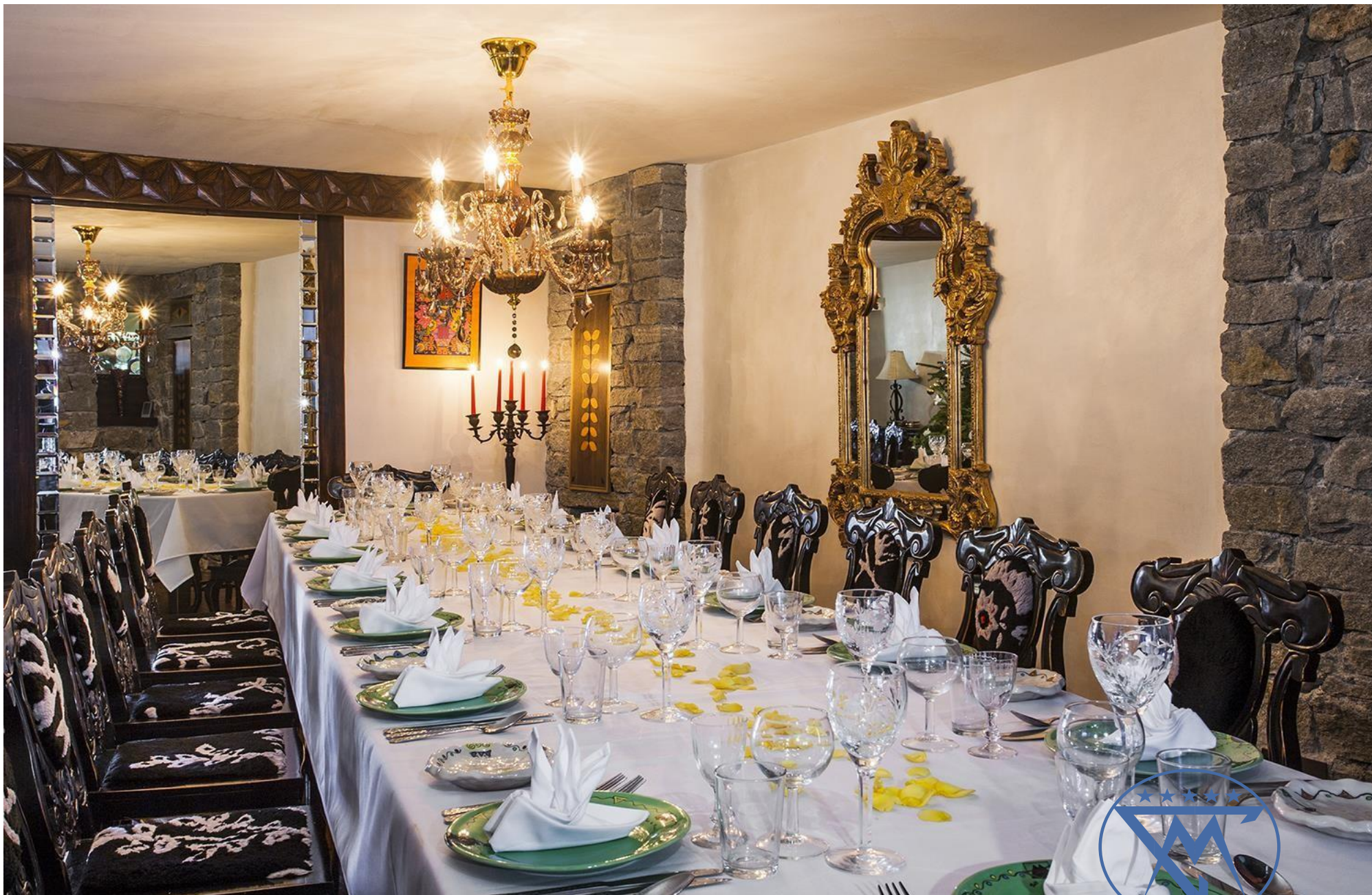
DOMAIN TOIT DU MONDE. Val d'Isere. France