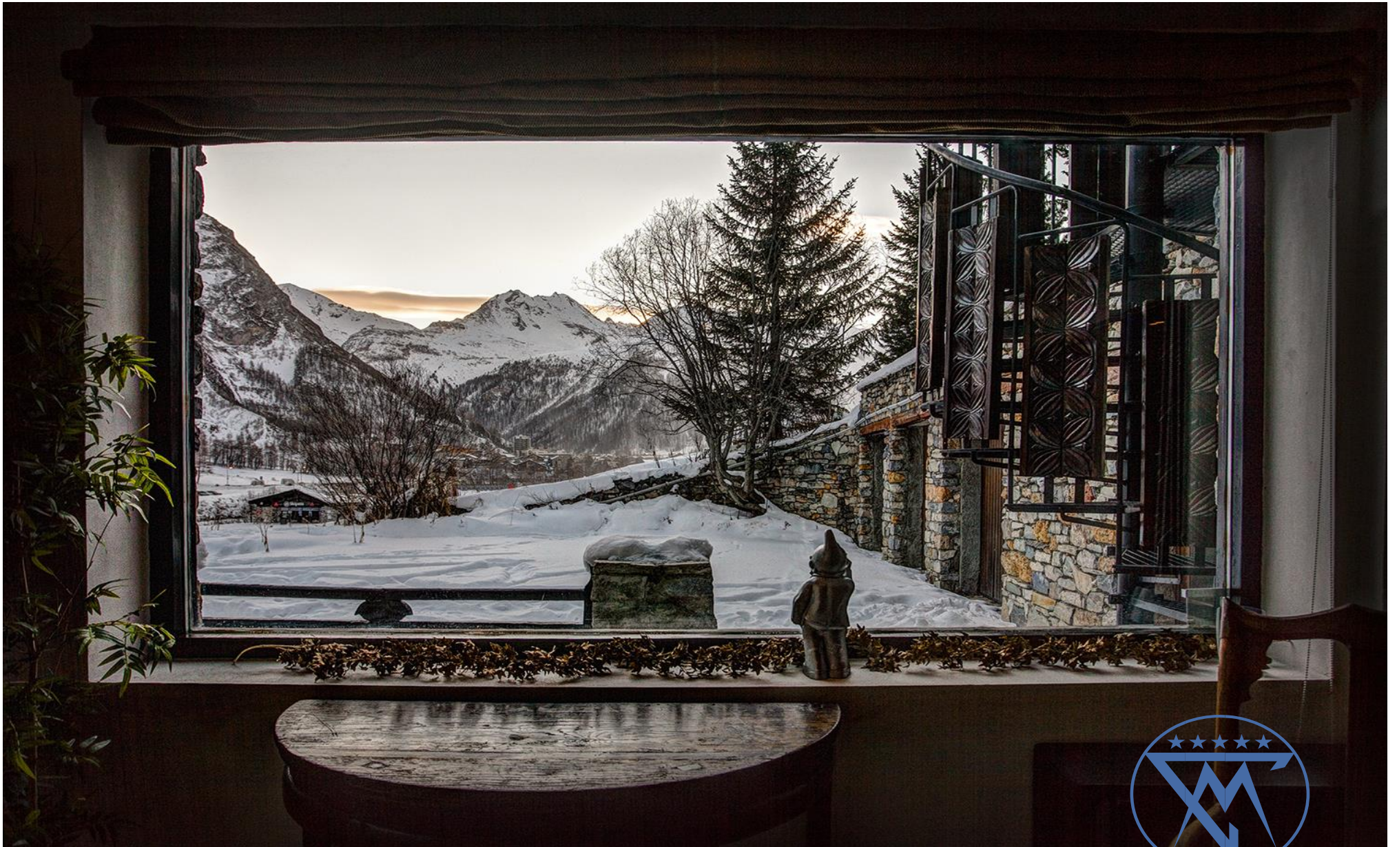
DOMAIN TOIT DU MONDE. Val d'Isere. France