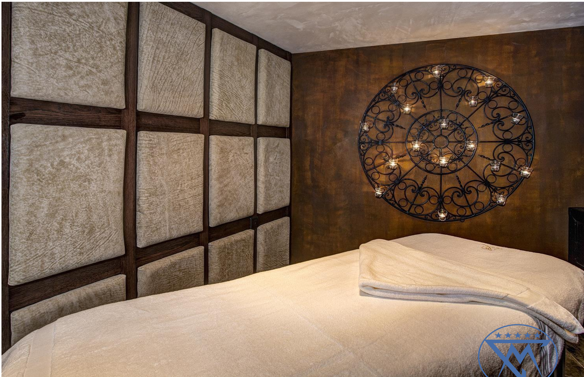
DOMAIN TOIT DU MONDE. Val d'Isere. France