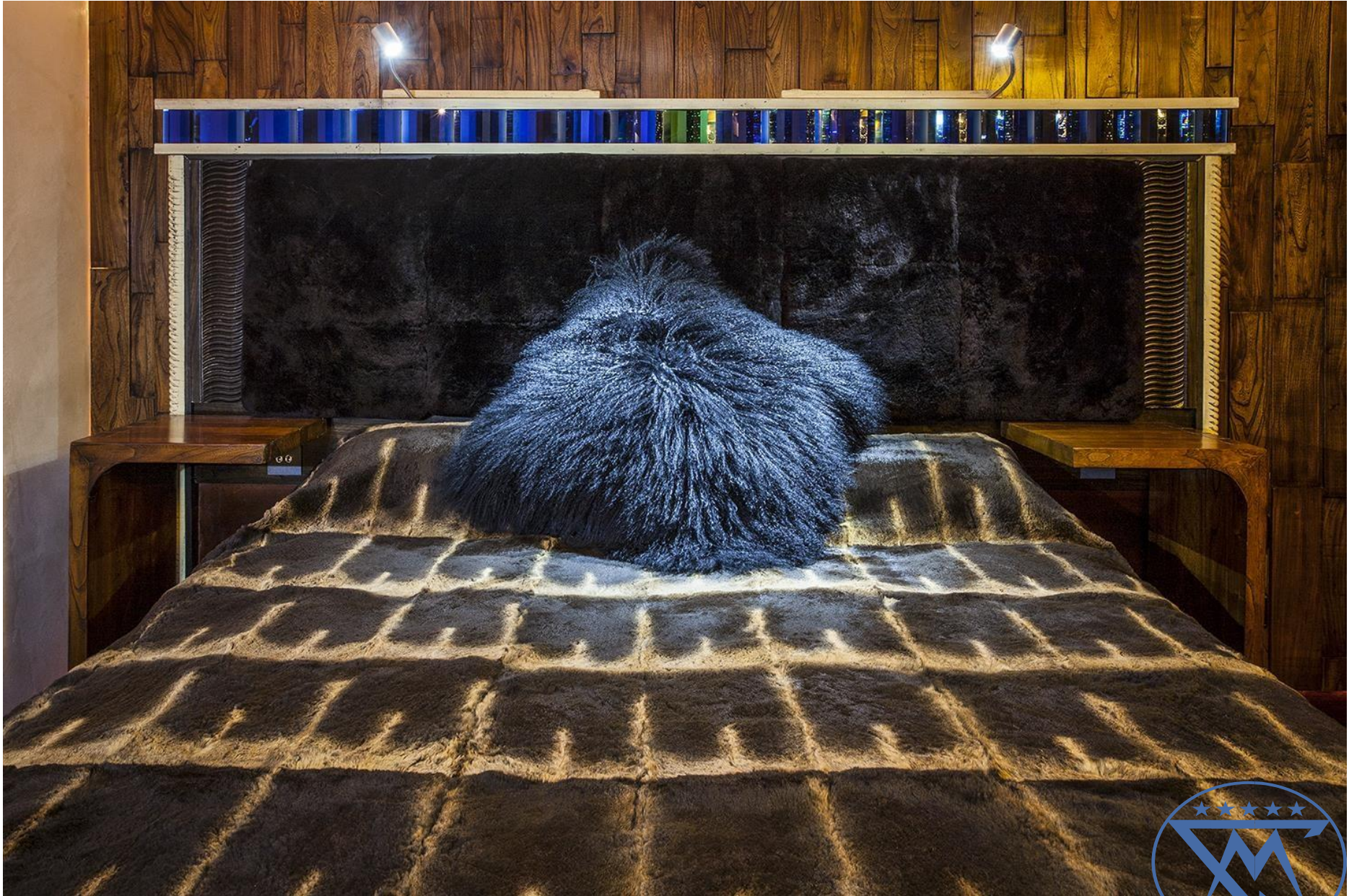
CHALET TOIT DU MONDE. Val d'Isere. France