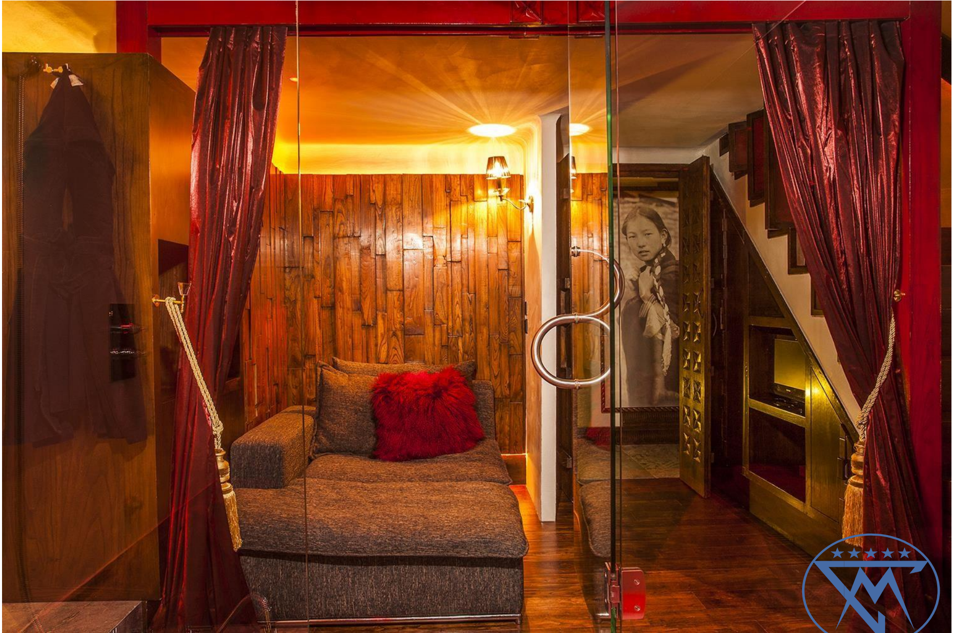
CHALET TOIT DU MONDE. Val d'Isere. France