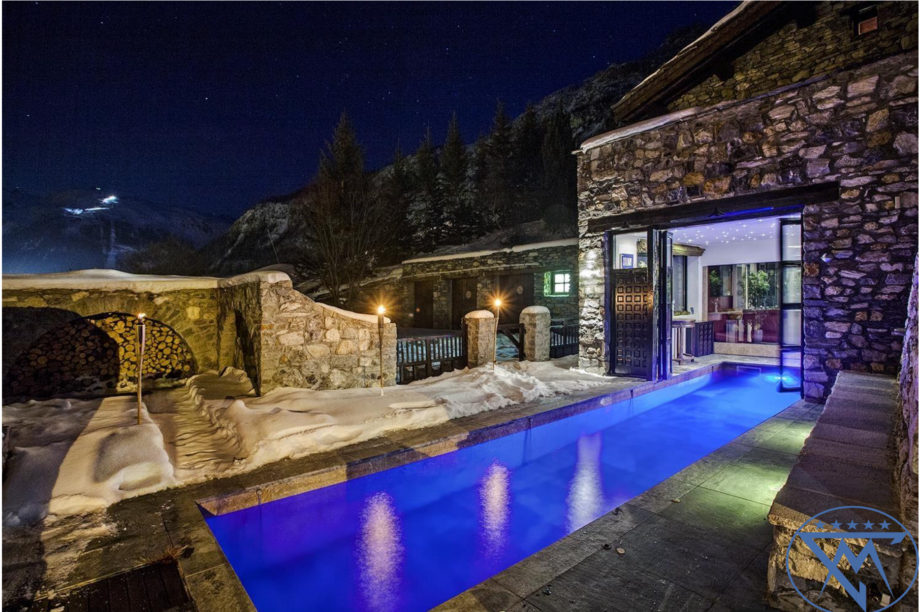
CHALET TOIT DU MONDE. Val d'Isere. France