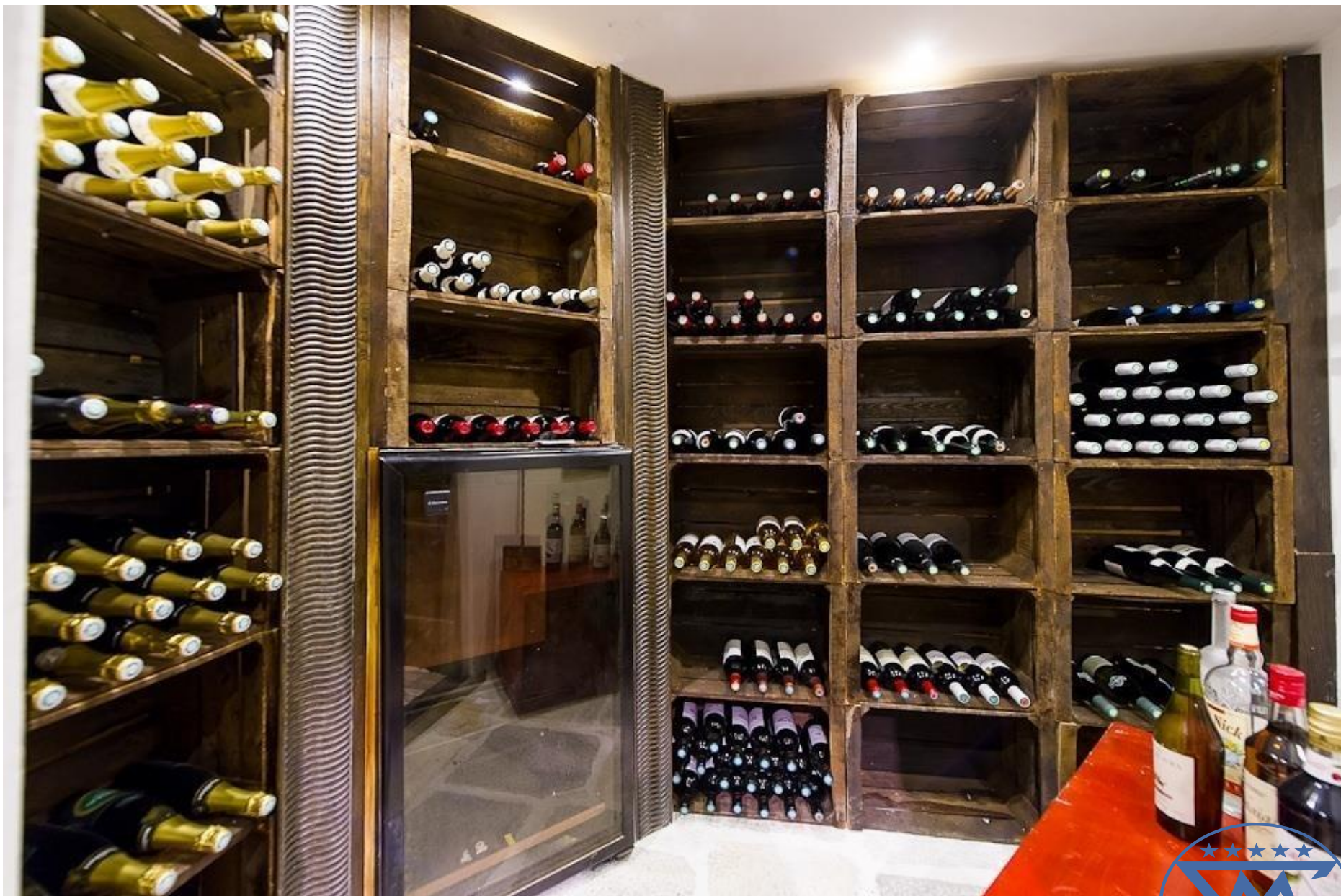
CHALET TOIT DU MONDE. Val d'Isere. France